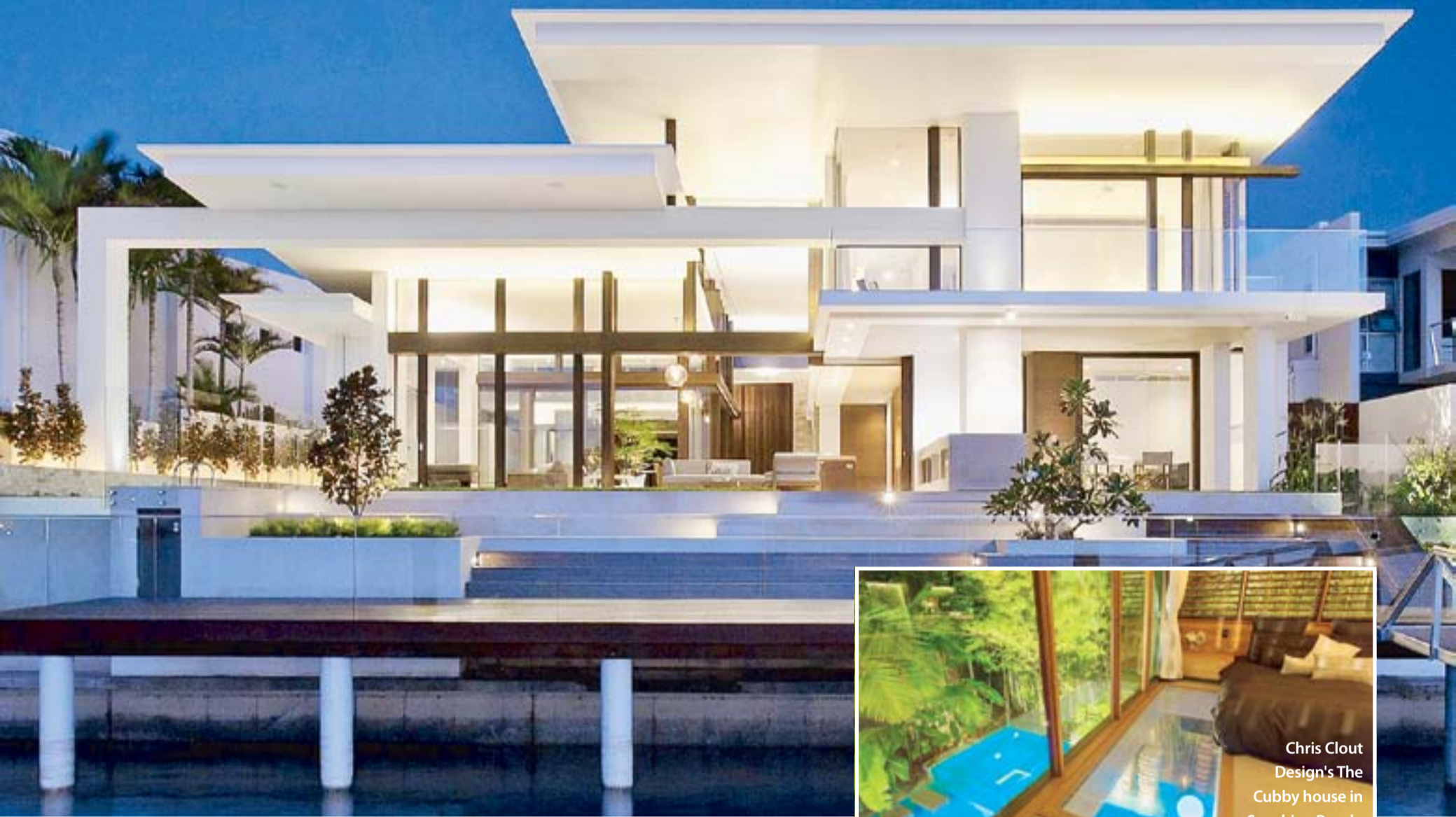
Chris Clout Design's The Cubby house in Sunshine Beach.

Gerard Smith Design's River House in Minyama has won the National Building Design of the Year award.