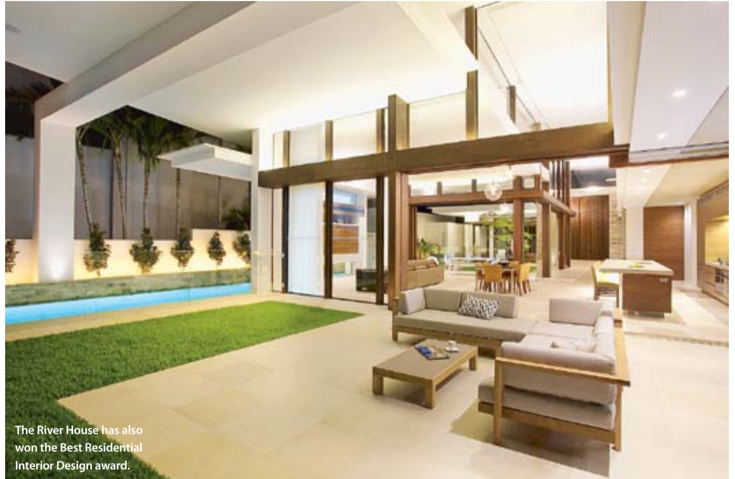
The River House has also won the Best Residential Interior Design award.

Chris Clout Design of Sunshine Beach also took out top honours for Best Alteration/Addition Residential Design up to $350,000 for their build named The Cubby House, located at Sunshine Beach